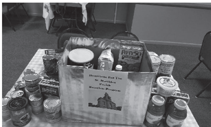
The ever-present collection box for the St. Matthias Parish Social Outreach Program with some of the items we collected at our Mass.