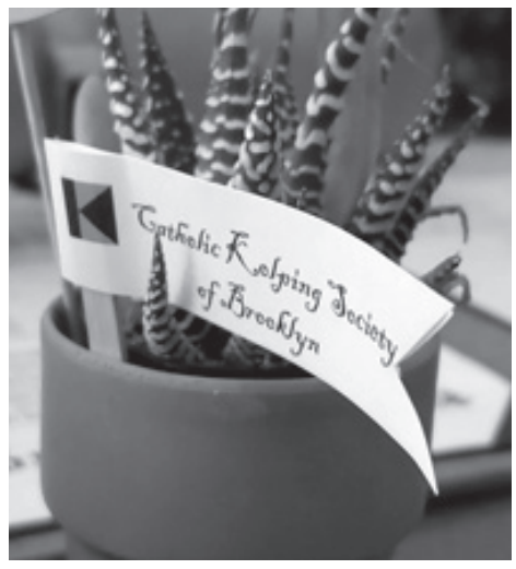
A small thank you gift from the Society to our volunteers.

had already helped with our restaurant arrangements for this special day. This is NOT a closed group...serve the society and you will be included next year! We all had a very nice time and left with a small 'succulent' souvenir of the day!