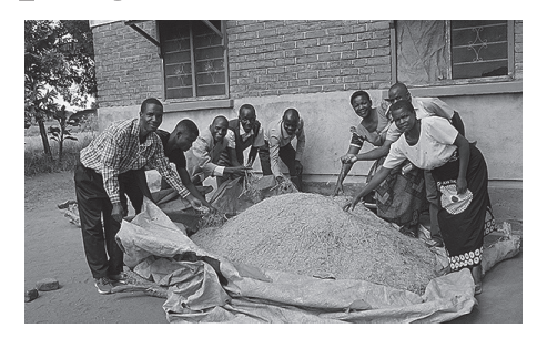
Malawi: Membership growth and intensive project work

The 72 hour campaign run by BDKJ, the German Confederation of Catholic Youth has had an impact on many countries outside Germany. 3,400 groups in Germany were joined by 45 international groups.