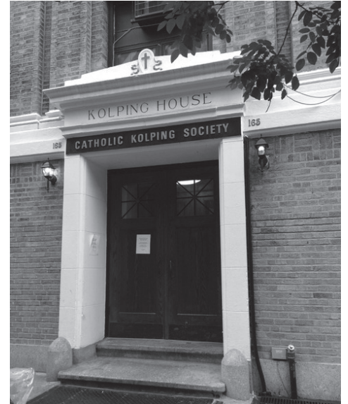
The outside of Kolping House - street view