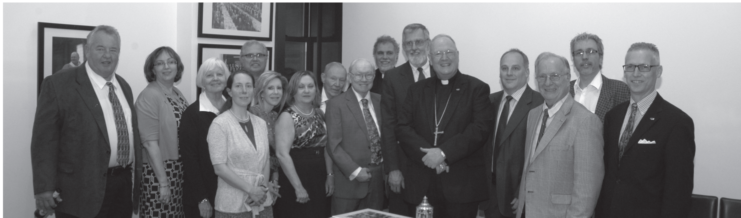
Cardinal Timothy Dolan with NY's Board of Directors in the National Office at our Centennial Celebration in 2014.

Treu Kolping, Your New York Catholic Kolping Family