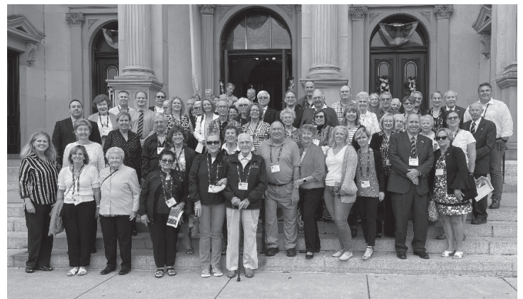
Mother of God Church (2)