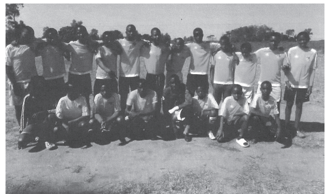
The St. Louis Kolping Kicks Soccer Club sent five boxes of jerseys to this group.