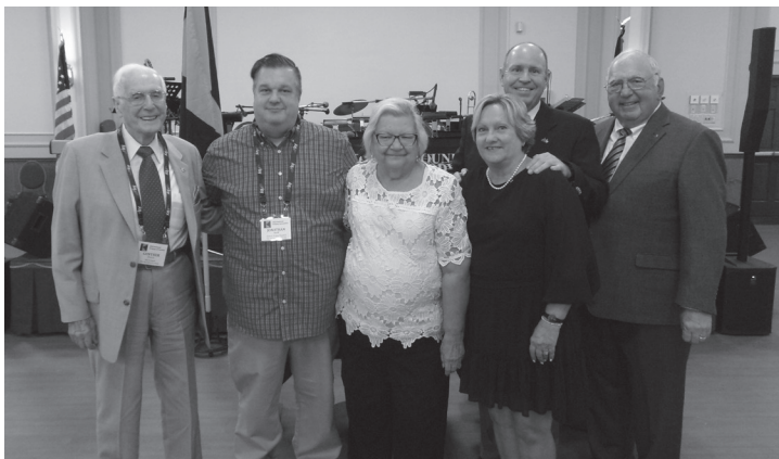
2020 DSA Recipients