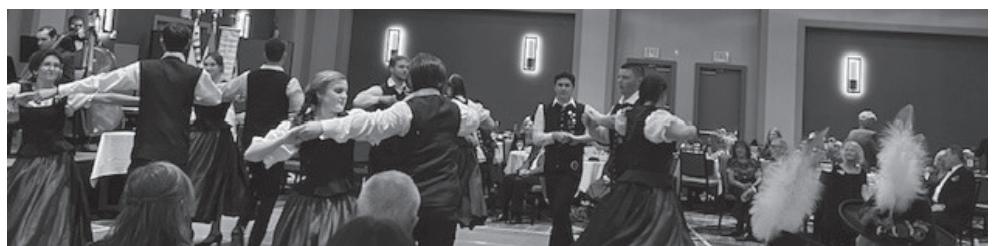
Donauschwäbische Vereinigung dance group