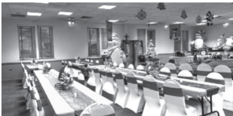
Our Kolping Center decorated and set up for Christmas!