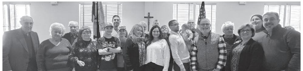
At our Board Meeting on January 20, the 100th Anniversary of our founding.