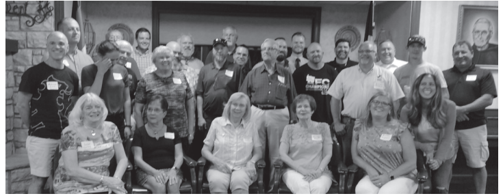
28 new members inducted in September of 2022.