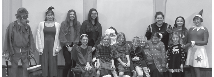
Photo taken at our Children's Christmas Party on December 11, 2022.