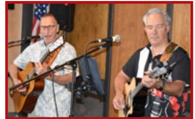
Seventeen Fingers entertaining the crowd