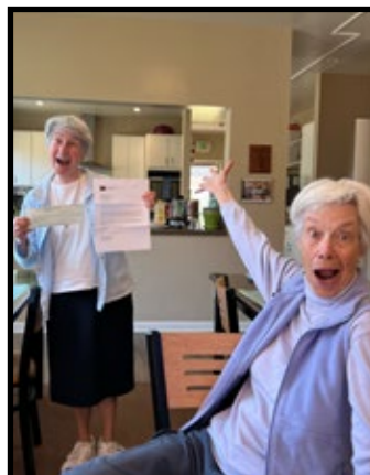
The "Sisters" at Gracenter receiving their grant check.