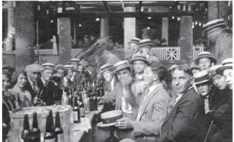
June 1924 at the Cincinnati Zoological Gardens

In 1930, Cincinnati Kolping purchased a former police station and bath house in the Over-the-Rhine district