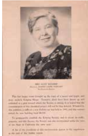
Kolping Ladies Auxiliary – page from the Silver Jubilee report – 1950