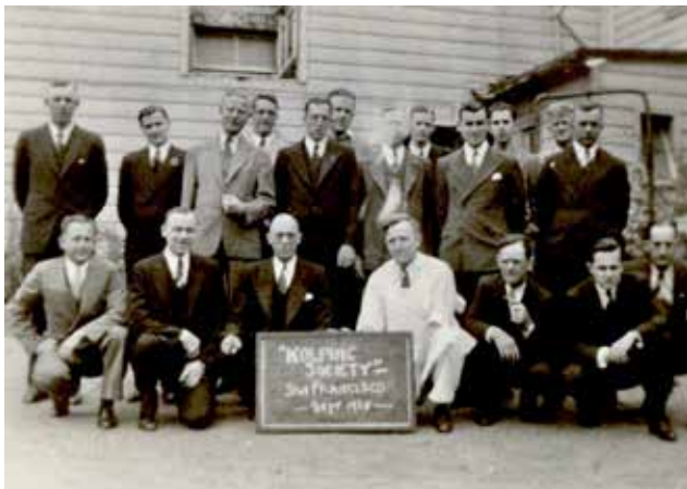
Kolping Society "boarders" – 1938