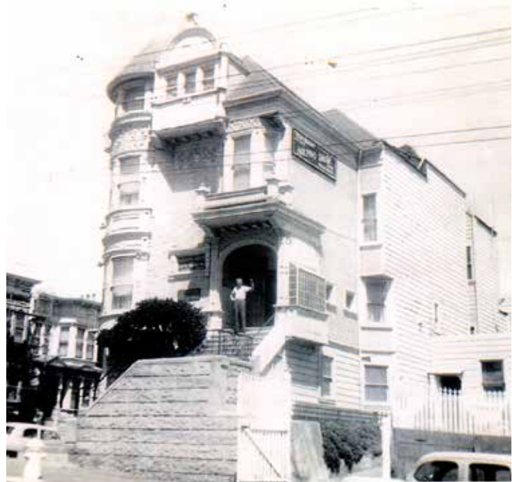
Kolping House with annex – circa 1952