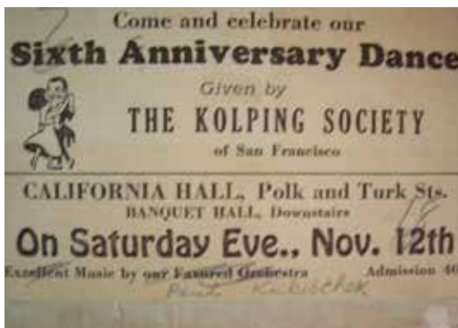
Let's dance! Admission, 40¢ – 1933